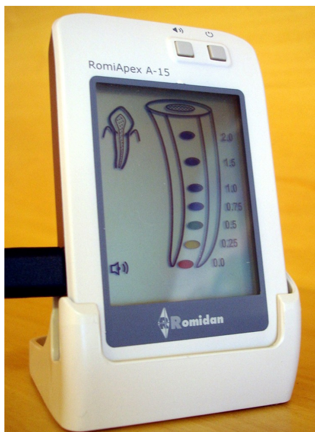
Figure 1. New Romiapex A-15 (Romidan, Israel).

The electronic foramen locator Romiapex A-15 (Figure 1, Romidan, Israel) was installed, being positioned the electrode of the mucous membrane in the labial commissural, and the electrode of the file in the intermediate of the instrument to be introduced in the canal.